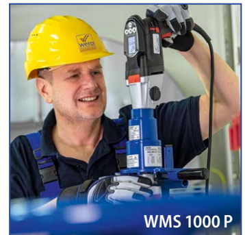
WMS 1000 P

You can find more information about us on our website: www.wero-antriebstechnik.de